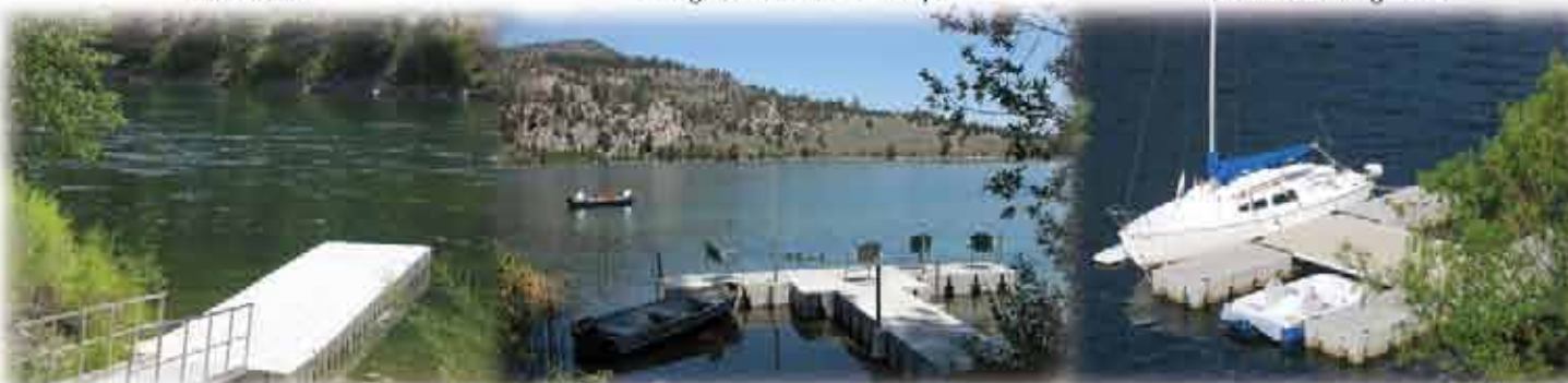
Attach to Existing Dock