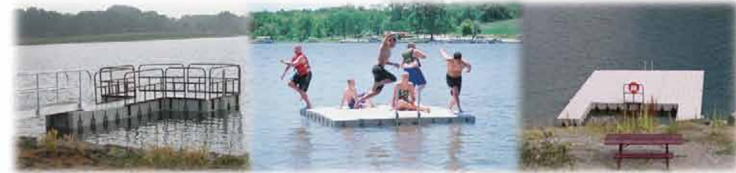
Courtesy Dock with Railings